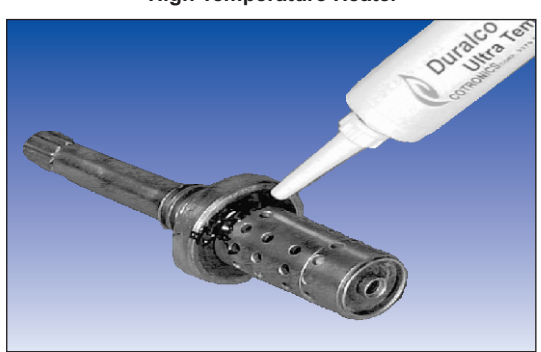
4703 Repairs a Valve Seal