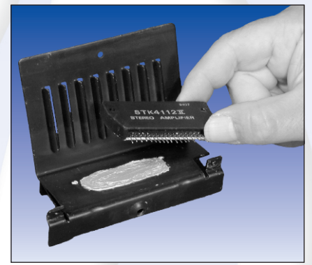
Duralco 132 Dissipates Heat in a Semiconductor Device

* Cures can be accelerated with mild heat